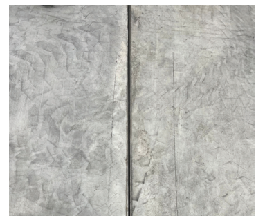
After Concrete is Placed With a Joint Opening of 1/4"

Beast Armored Joint offers superior performance and easier installation at a lower cost when compared to other armored joint alternatives - providing installers, specifiers and building owners with unmatched value .