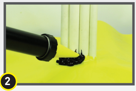
Where multiple pipes are close together, place mastic around and between all individual pipes