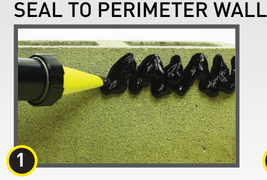
Apply Stego Mastic liberally (~2 inch width and minimum 60-mils depth) behind where Stego Wrap will terminate