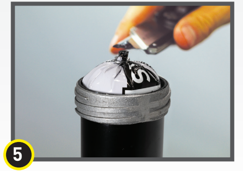
Cut, poke or slice a small hole in the Stego Mastic Sausage Tube just below the metal clip