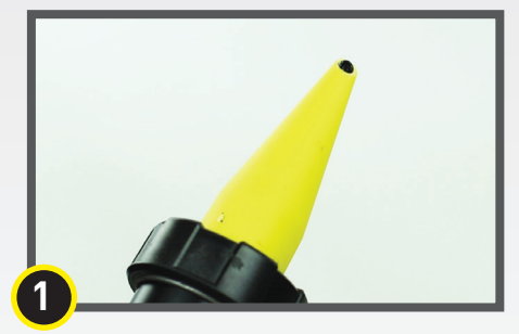
Stego Mastic is ready to apply

• To seal around penetrations in Stego Wrap, cut Stego Wrap just big enough to fit over and around the penetration so as to minimize void space. Liberally apply Stego Mastic around the penetration to create a monolithic membrane.