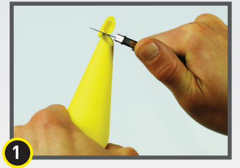
Cut nozzle to the desired width