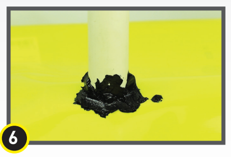
Completely sealed pipe penetration