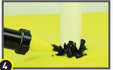
Same as #3, single pipe shown