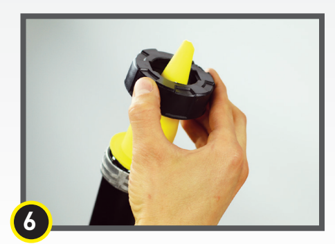
Place the nozzle over the top of the chamber/mastic tube and screw the lid back over and onto the mastic gun